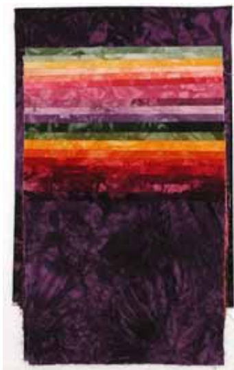
CHARM PACK PLUS