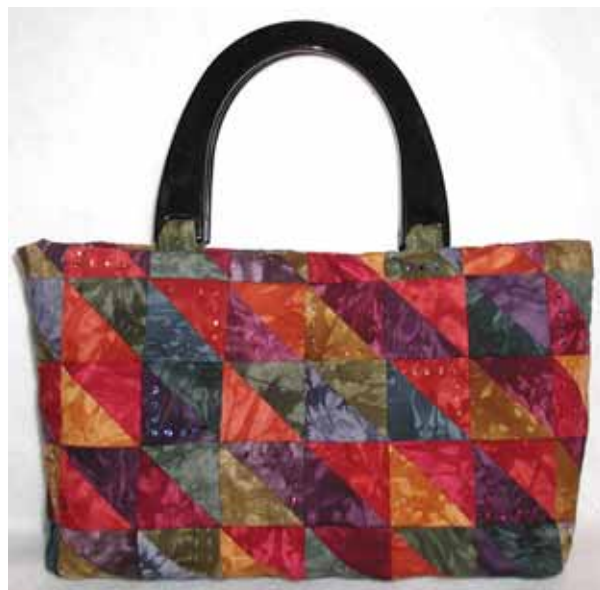
HALF SQUARE TRIANGLES CHLOE HANDBAG #120