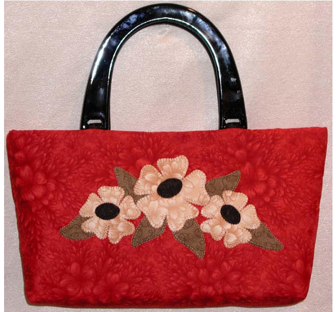
NANCY'S FLOWERS ON CHLOE HANDBAG #120