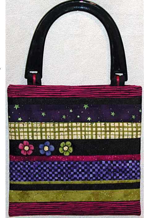
'Midnight Garden' Katy Bags #121