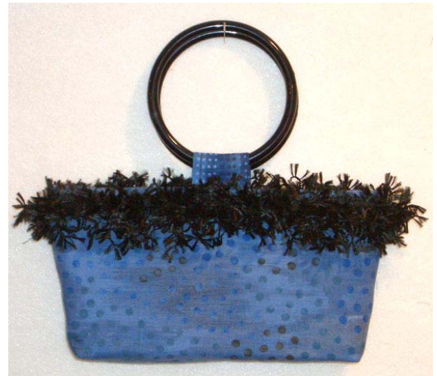
CHLOE HANDBAG #120

In 'Step 9 - Finish the Bag' make the size of the opening in the lining larger to accommodate the handles when turning the bag right sides out. Where it says 'Stitch 3" in from the notches on the long raw edge of the lining...', only stitch 2", leaving approximately 6" unsewn at the middle of this edge to turn the bag right sides out.