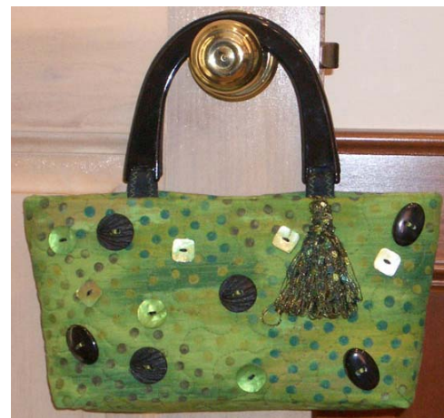
ALL-OVER BUTTON DESIGN