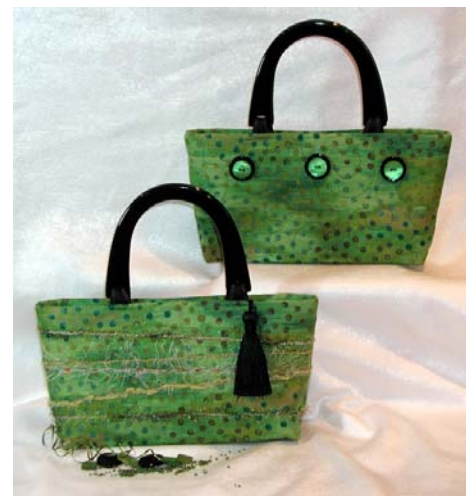
CHLOE HANDBAG #120